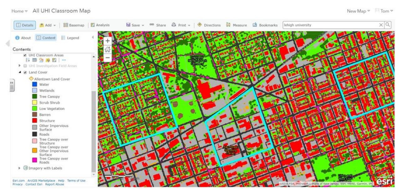
Figure 2. Land cover map allowing students to study urban heat island effects across the entire city. The blue polygons are assigned neighborhoods for student groups to examine a suburban neighborhood (west side of map), a commercial district (center), and a dense residential district (east).

In the next step of the investigation, students analyze a GIS map of the land cover in their city. This map displays both built environment features (structures, roads, impervious surfaces such as parking lots) and natural features that help reduce the urban heat island effect (vegetation and tree canopy, including trees that shade structures and roads). Students then examine an assigned neighborhood in their city (see Figure 2) to analyze the land cover and discuss how it contributes to the urban heat island effect.