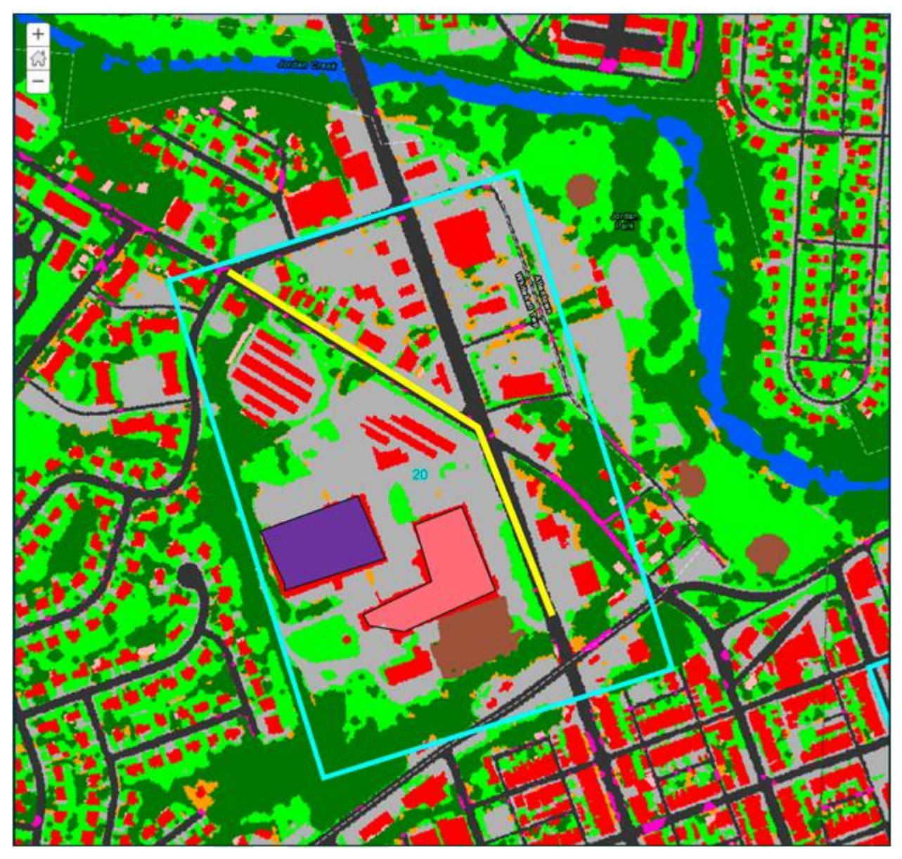
Figure 3. Sample student product from the Urban Heat Island investigation. To reduce the UHI effect in the assigned zone, this student has added a green roof with a garden (purple), white roof instead of a black roof (pink), and changed street to light asphalt (yellow).

After discussing the existing land cover and possible mitigation strategies, students propose several changes for their assigned neighborhood. For example, students suggested converting dark rooftops to light-colored rooftops, creating shade by adding rows of trees within parking lots, modifying large commercial structures to incorporate green roofs, and other recommendations that increase reflection and decrease solar energy absorption by a surface. Students then use the suite of draw tools to make these changes on their ArcGIS.com map and submit their recommendation to their teacher (see example in Figure 3).